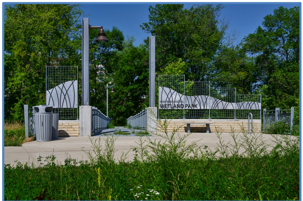
One entrance to the Iowa River Landing Wetlands Park. The area encompasses restored wetlands, hiking/biking trails, a detention pond, and landscaped recreation areas.

In conjunction with the wetlands park, the city continues to add to its Clear Creek Greenbelt—a system of pedestrian and bike trails on both sides of Clear Creek. “The city has been doing a great job of working to restrict future development in the floodplain,” Rumpza says.